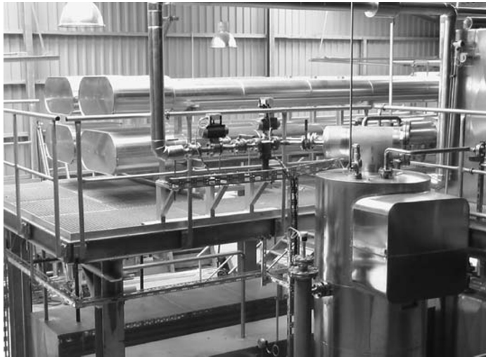
4.2 Large-scale TDH unit.

retention time is 20 minutes. The hydrolysed substrate is cooled down to almost process temperature using the heat exchanger. Finally, the pressure is released (Dingreiter, 2007). Figure 4.2 shows such a unit.